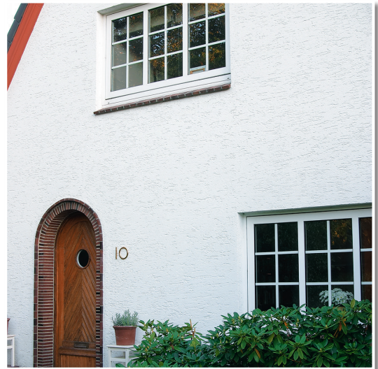
House façade protected and embellished with WEISSES HAUS REIBPUTZ AUSSEN.